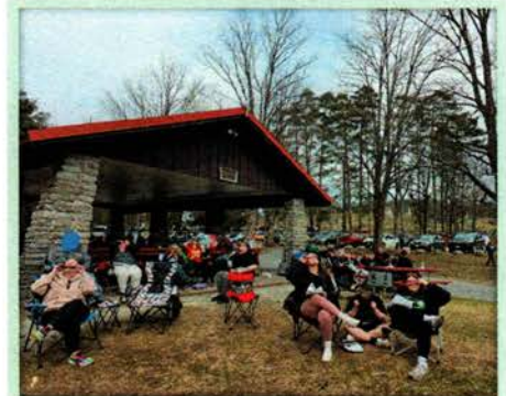
Herkimer earth science students viewing the eclipse in Boonville.

Follow us on Facebook, X and Instagram: @herkimercsd